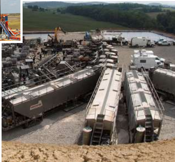
Crown 900 Houston, TX